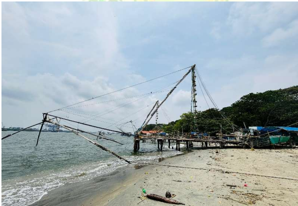
Pic- Chinese Fishing Nets