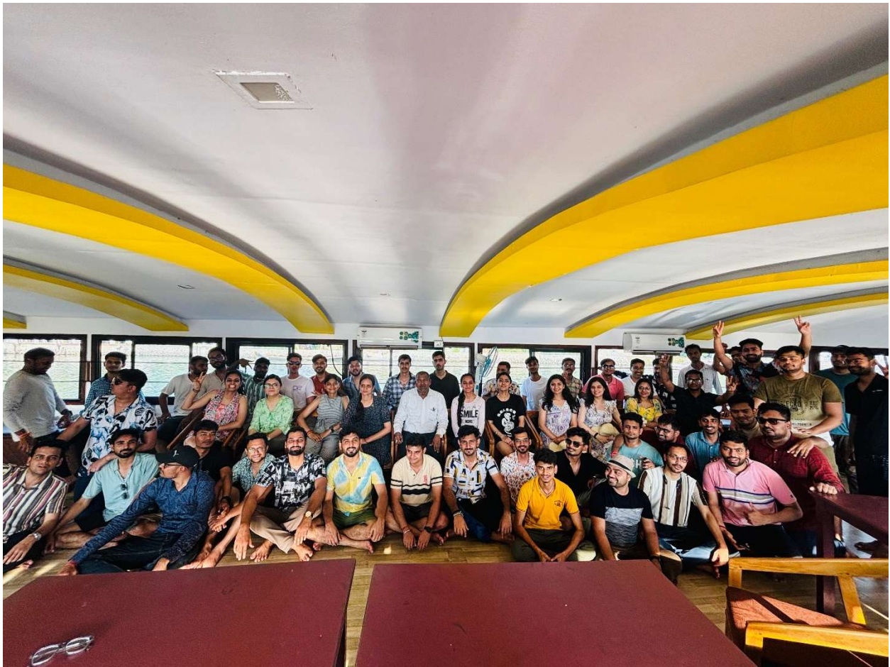
Pic- Group photo in cruise boat in Alleppet Backwaters

The economy of Alleppey is based on paddy farming, tourism and coir industry. Alleppey is part of Kuttanad region, this region has the lowest altitude in India, and is one of the few places in the world where farming is carried on around 1.2 to 3.0 meters below sea level. The region is known as the rice bowl of Kerala and it is also the part of second largest Ramsar site in India. To stop the saltwater intrusion into the Kuttanad, a 1252m long saltwater barrier, Thanneermukkom has been built on Vembanad lake.