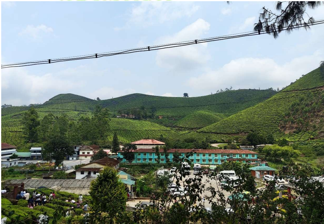
Pic- Tea estate, Munnar

Tea has played an integral part in the history of Munnar. Tata tea museum has photographs and machineries, which chronicle the journey of tea in the area. The museum set up at the Nallathanni Estate of Tata Tea ensures that the legacy of those who worked hard to ensure the tea plantations survived this long is recognised publicly. We got to watch the transition from the rudimentary tea roller to the modern fully automated tea factory. Various stages of tea processing can be seen, which includes the making of black tea. There was a sundial, placed on a granite block, which was made in 1913 by the Art Industrial School at Nazareth, Tamil Nadu. We tasted some of the most exotic varieties of tea available around the world here.