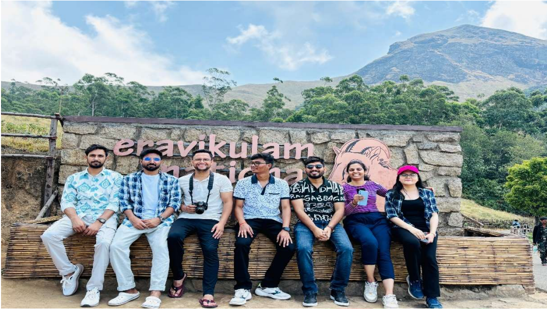
Pic- Eravikulam National Park

In the morning we departed for Eravikulam national park which was 15km from our hotel. It is situated in the Kannan Devan Hills of the southern western Ghats. The wildlife park has an area of 97 sq. km. and it is the first national park in Kerala.