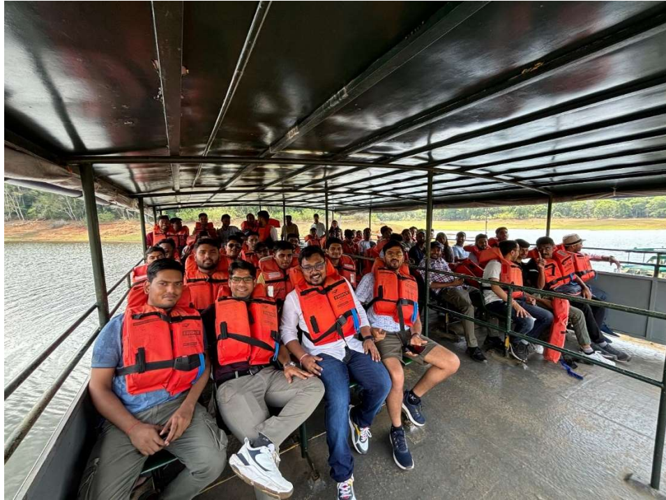
Pic:-Boating in Periyar Tiger Reserve

ii. From Periyar tiger reserve, we proceeded to our next destination Munnar and reached there by 11pm. On the way from Thekkady to Munnar we witnessed many tea, spice and rubber plantations at Spice garden and getting to know about various ayurvedic plants used for treatment of different kind of diseases.