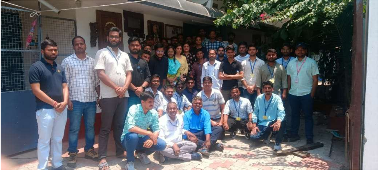
Pic- Visit to Theruvoram NGO